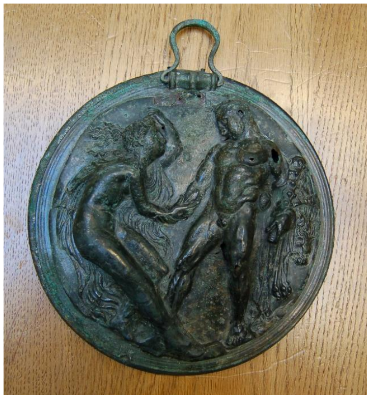
Fig. 10. Heracles and nymph: Box mirror with relief. Bronze. Originating from Corinth. London, British Museum, 293 (1892,0719.4). c. 300-280.

predominant figure decorating mirrors, whether Corinthian or Attic 24 , Ionic or Chalcidian, is Aphrodite. Sometimes she is alone, however very often she is with Eros, as in the Chalcidian mirror from Eretria. This is the most common combination, leaving room for variation. In a mirror preserved in Tübingen, probably of Corinthian origin, Aphrodite plays with Eros 25 . In an Ionic mirror from the Hermitage, found on the Taman peninsula in the Black Sea, Aphrodite kisses the young Eros while seated upon a diphros holding him in her lap 26 . In several examples different animals accompany the goddess, whom she plays with, embraces, caresses, feeds and even rides. The birds related to the goddess of love are perhaps the most frequent. In some cases, the animals represented indicate the epithets by which Aphrodite is worshipped.