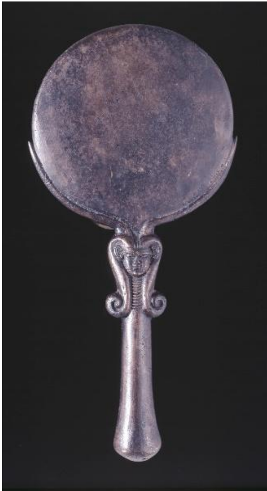
Fig. 2. (left) Egyption hand mirror: Bronze. London, British Museum, EA29428 (1897.0511.144). New Kingdom.